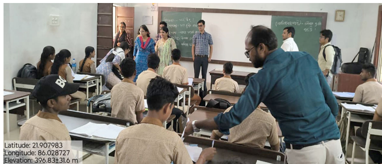
Latitude: 21.907983 Longitude: 86.028727 Elevation: 396.83±31.6 m