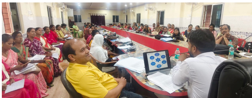
Persons from SIRD & PR.

The training program are commenced in various districts, with 1650 Village Resource Persons (VRPs) already