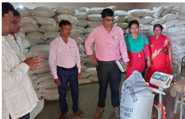
The team verified the stock at Bhunsuli GP of Koraput Block, Koraput district