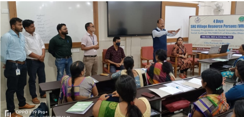
4 days residential training imparted to Village Resource Persons at KIIT campus, BBSR, from 18.07.2022 to 21.07.2022