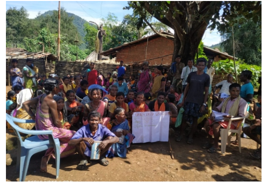
Social Audit Gram Sabha conducted in Jantri GP of Chittrakonda Block, SWAVIMAN area of Malkangiri district.