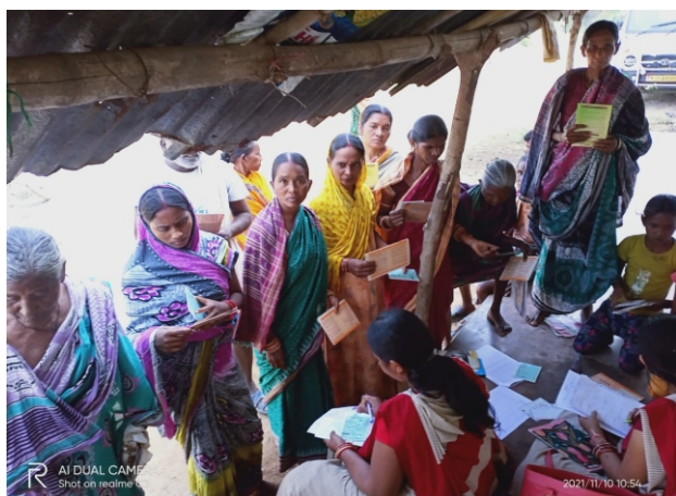
Beneficiaries verification of NFSA scheme of Jhilminda GP of Attabira Block Bargarh district