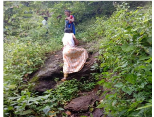
This is the only way to move Taberu village of Jantri GP. To reach this village, RPs have to cross 17 km. of hilly roads.

The Social Audit team usually visits all the MGNREGS worksites and verifies the following points: